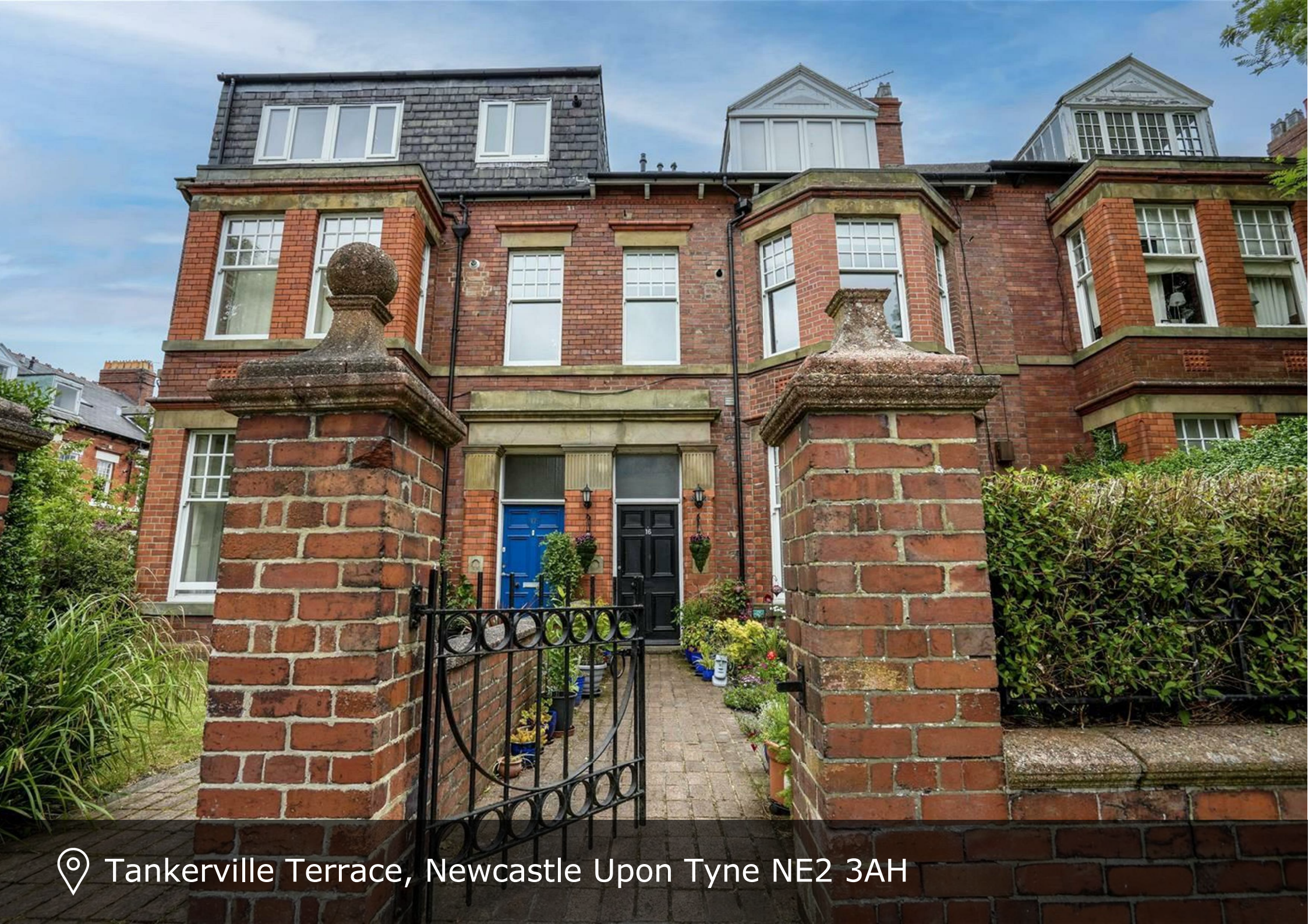
📍 Tankerville Terrace, Newcastle Upon Tyne NE2 3AH